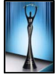
Electra Award 2005