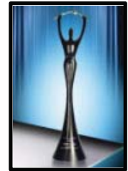
Electra Award 2005