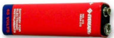
Industry Standard Dimensions in mm (inches)