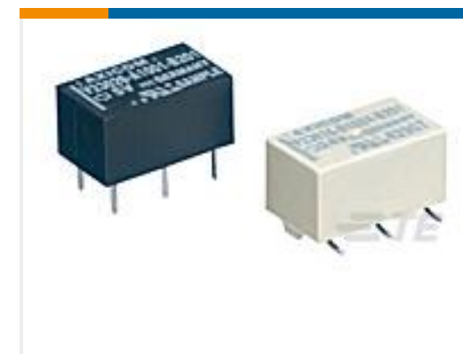
TE Model / Part #1393774-1 V23026A1001B201