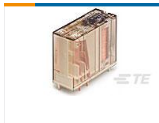
TE Model / Part #1-1393258-7 V23047-A1024-A511