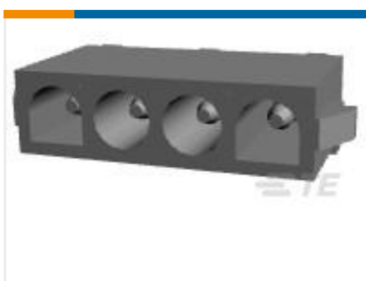
TE Model / Part #350792-1 04P UMML PIN HDR ASSY 94VO