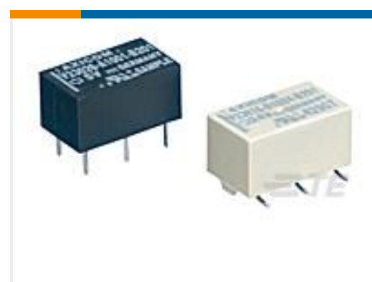
TE Model / Part #1-1393774-2 V23026A1004B201