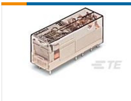
TE Model / Part #4-1415053-1 SR4M4024