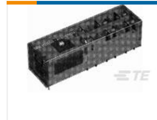
TE Model / Part #1393260-7 SR6B4024 - V23050-A1024-A542