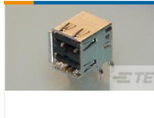
TE Model / Part #5787617-1 RECP ASSY, R/A, STACKED, THRU- HOLE, USB,