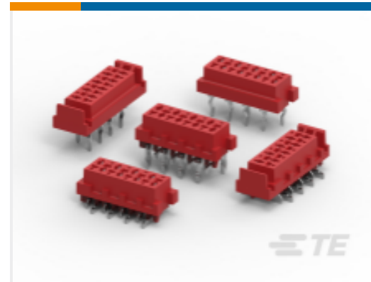
TE Model / Part #8-188275-0 FEMALE-ON-BOARD CONNECTOR TOP ENTRY