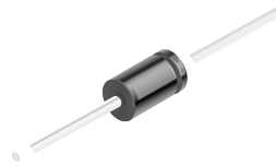
DO-35 Glass case COLOR BAND DENOTES CATHODE