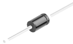
DO-41 Glass case COLOR BAND DENOTES CATHODE