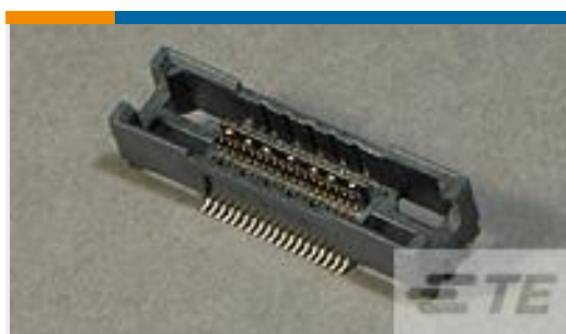
TE Model / Part #2-5767004-2 MICTOR RECEPT ASSY, 38 POS.