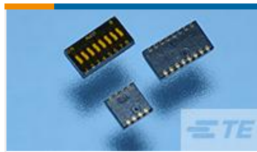
TE Model / Part # 1977831-5 DIP SWITCH GDH10SATR04