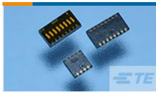
TE Model / Part # 1977831-4 DIP SWITCH GDH08SATR04