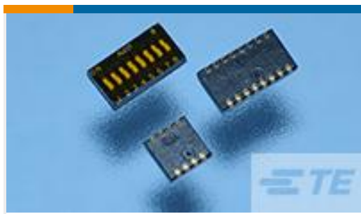
TE Model / Part # 1977831-2 DIP SWITCH GDH04SATR04