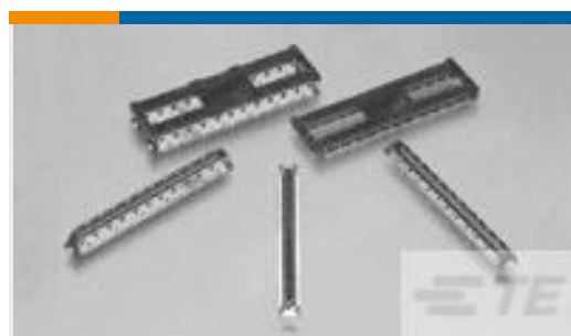
TE Model / Part #3-1827253-6 .5FHP05H,220,S,GIG,08/Sn,HT,NSYes