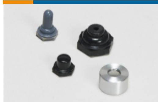
Switch Boots & Accessories(1)