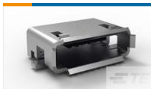
TE Model / Part #1981584-1 MICRO USB, TYPE A/B, GRAY