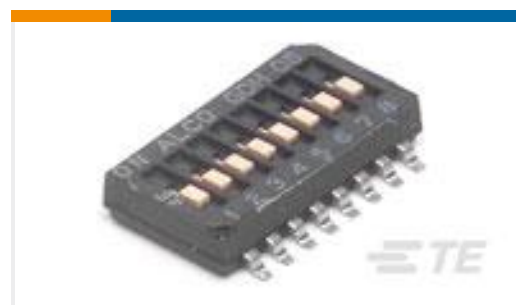
TE Model / Part #1571983-5 GDH04STR04=DIP SWITCH