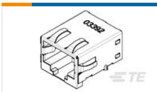
TE Model / Part #1888542-3 MJ,10MM,8P,WAVE PANEL TABS,SN