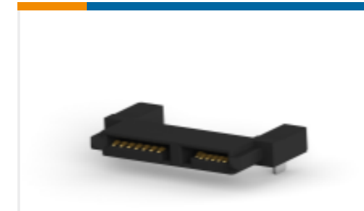
TE Model / Part #1-1735413-1 Assembly Slimline SATA Receptacle 7P+6P