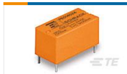
TE Model / Part #4-1415535-6 PE034005