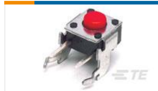
TE Model / Part #1571610-2 Sealed R/A Tact switch, Sealed