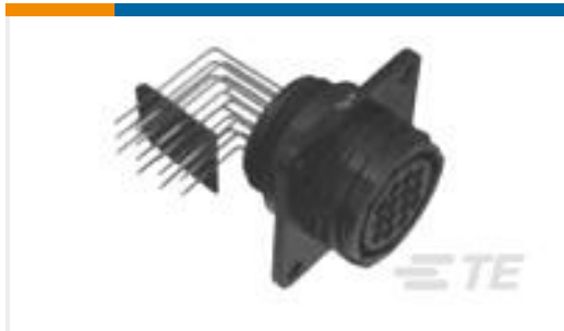
TE Model / Part #796375-1 CPC POSTED RCPT,13-9,R/A